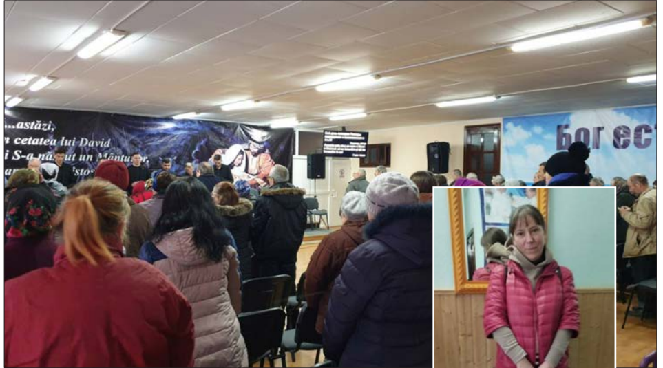
New people and fate of life. The number of those in need has increased since the pandemic and also as an effect of the war in Ukraine.