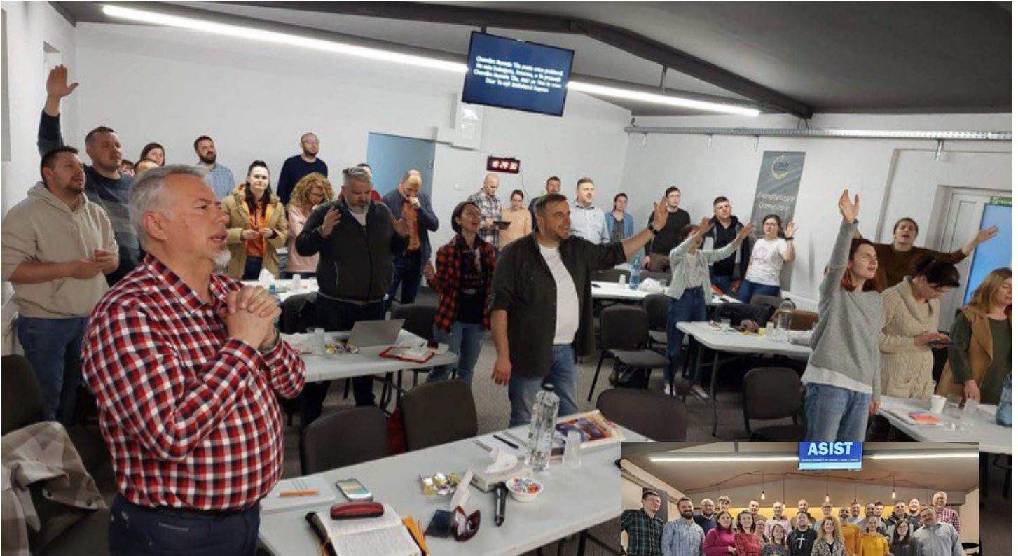
With warmth and gratefulness the teaching from the word of God is received. It is gratifying to see that both men and women are participating.