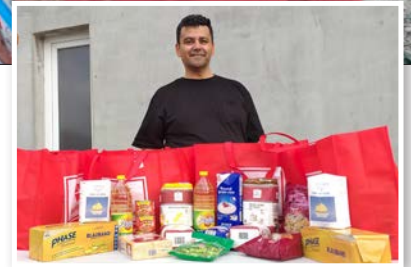
The food package that was distributed.

A few days ago, I listen to a conversation that touched one of the mysteries of faith – prayer. This aroused several thoughts about prayer. To pray is every Christian’s calling. The notion that someone is praying for us, is one of life’s greatest privileges.