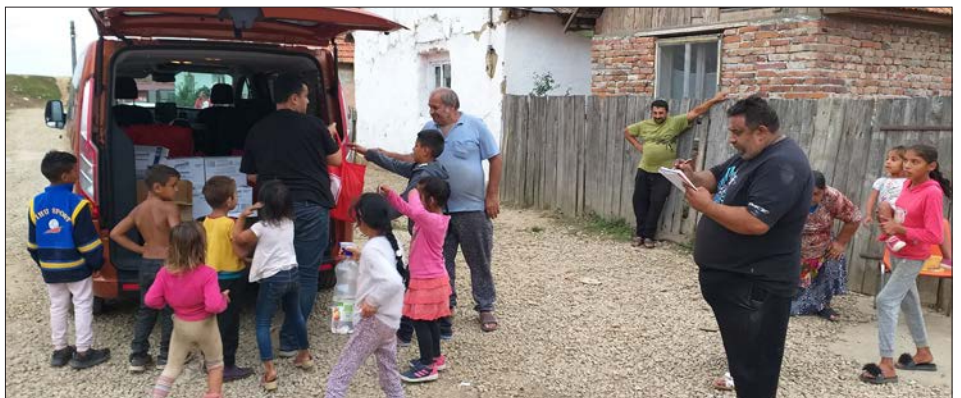
For many, it is about meeting today’s needs. To live solely on the child support is difficult, especially when the families often have many children to feed.

A food package and a sack of potatoes cost $30 per family per week. It covers the most basic needs for each family and will keep the most acute hunger away. Thank you for standing alongside us in this project.